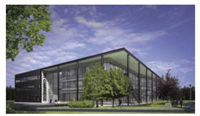
Background: the lobby of the new 101 Cambridge Above: computer-generated image of the new 101 Cambridge

The tests involve the identification of specific biomarkers of disease in patient samples such as blood, urine or saliva. These new detection systems are