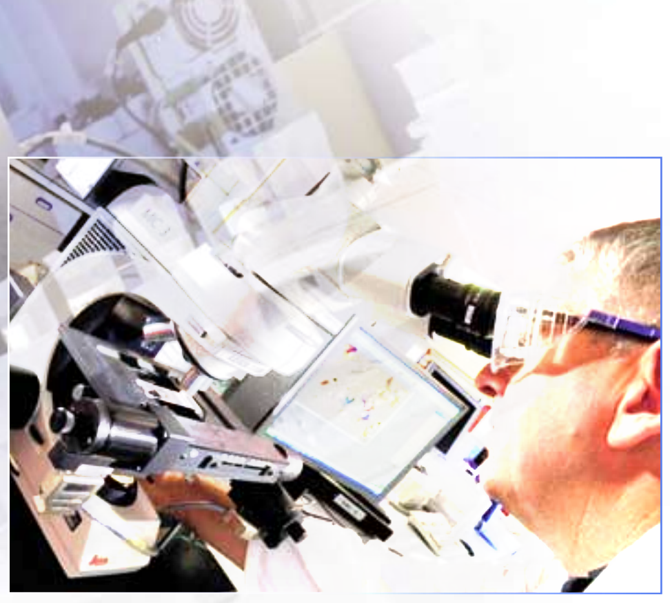
Left and above: work at the Pharmorphix® laboratories on Cambridge Science Park

through the use of an innovative solid form that demonstrates enhanced utility in a particular area.